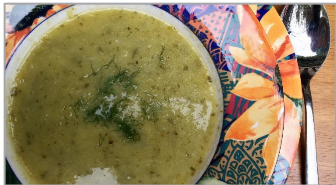
Zucchini & Fennel Soup

Many cafes sell soup by the mug - add Sweet Potato chips for crunch.