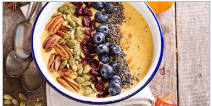
Banana Carrot Smoothie Dx165