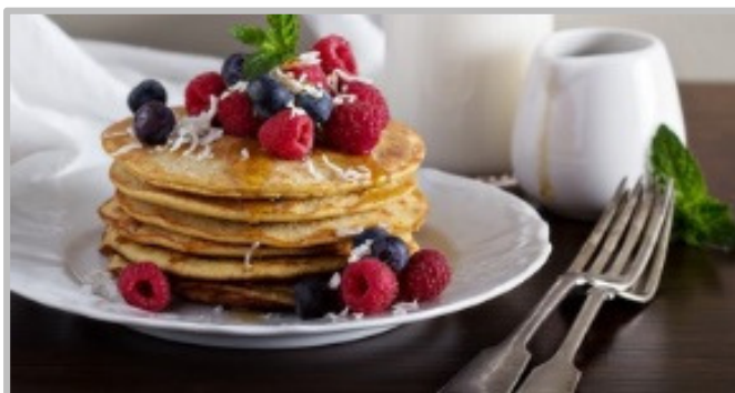
Coconut Paleo Pancakes Dx144