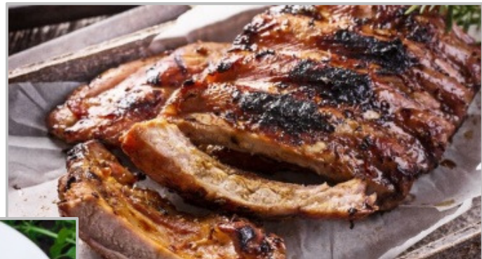
Chef's Secret Barbecue Ribs