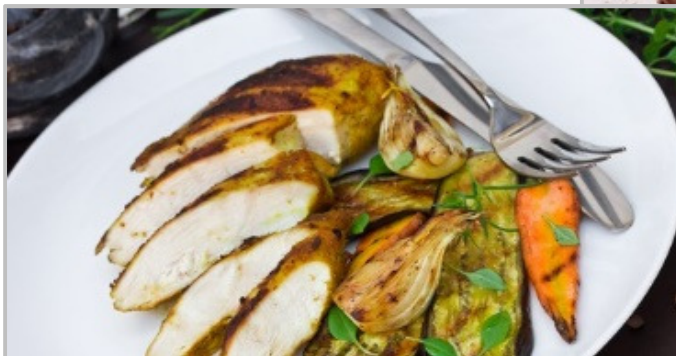
Spicy Cajun Chicken